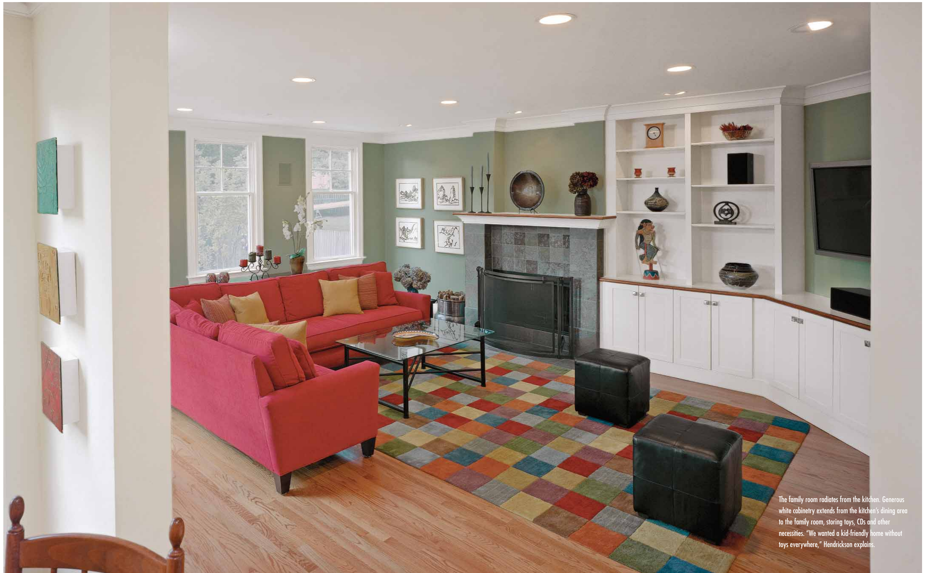
The family room radiates from the kitchen. Generous white cabinetry extends from the kitchen's dining area to the family room, storing toys, CDs and other necessities. "We wanted a kid-friendly home without toys everywhere," Hendrickson explains.